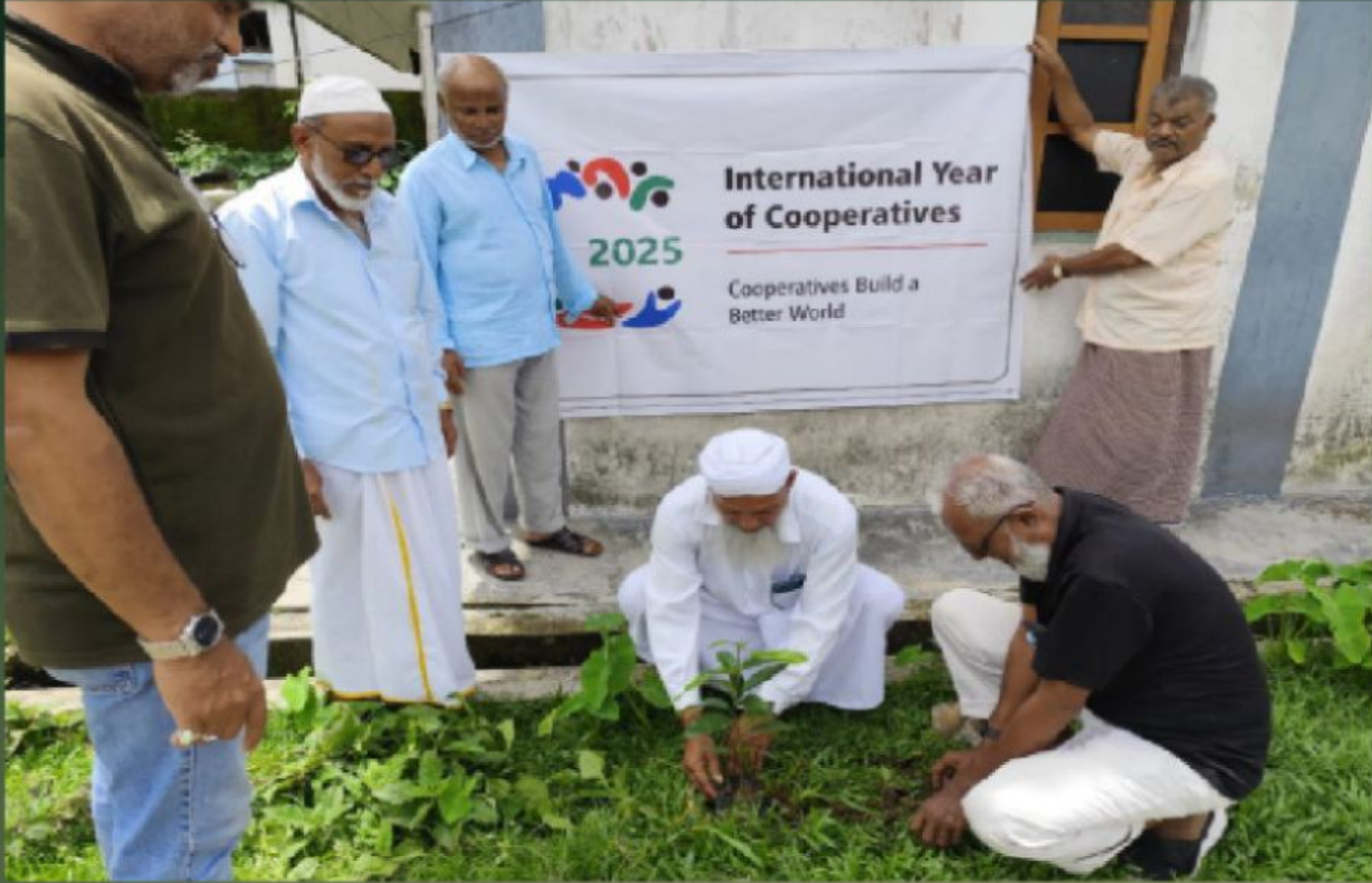
Tree Plantation Drive – “Ek Ped Maa Ke Naam” held at the office premises of Bapuji Service Cooperative Society Ltd., Wimberlygunj on 28.05.2025