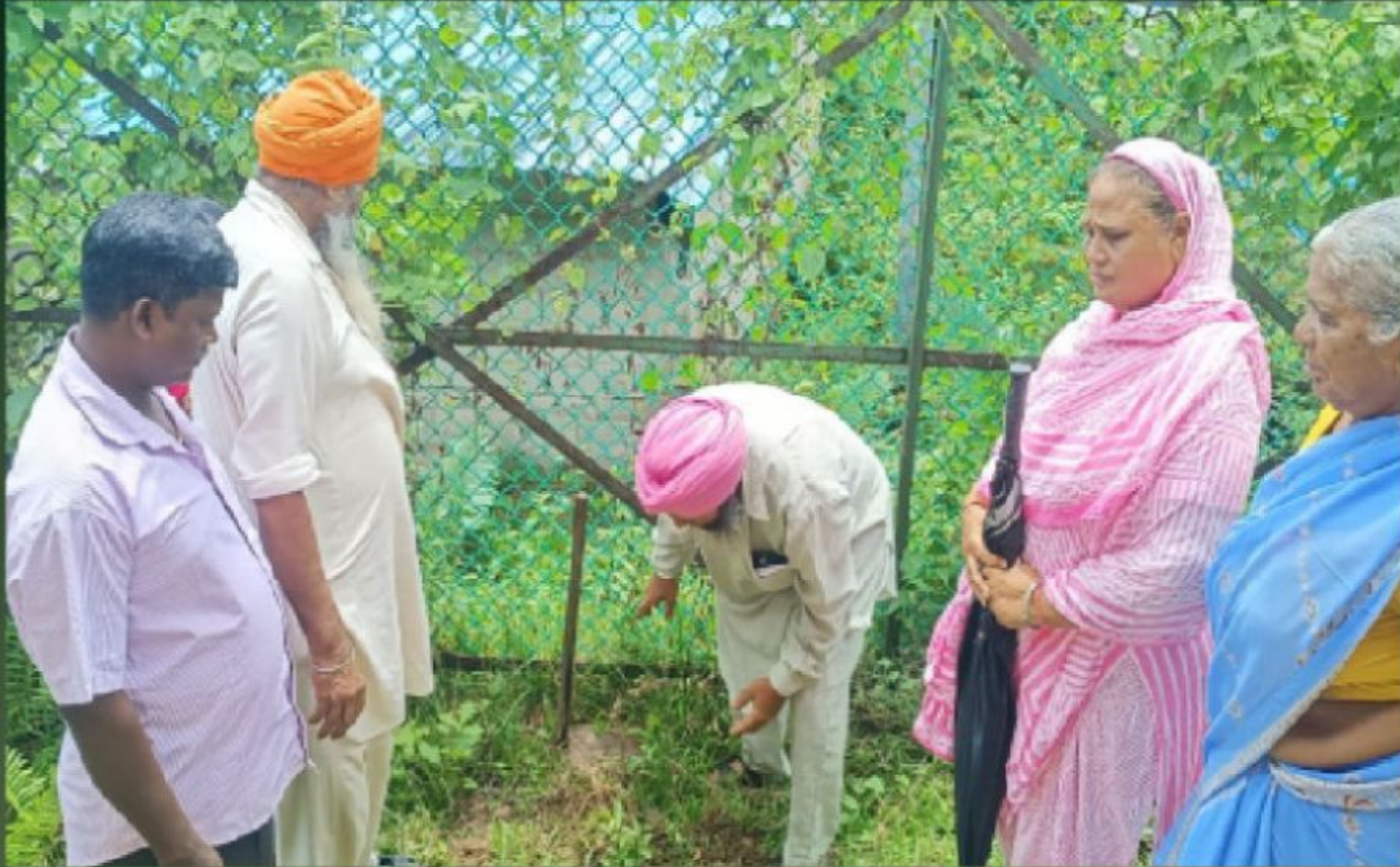
An awareness cum tree plantation programme under the theme "Ek Ped Maa ke Naam" was conducted by the officials of ARCS Office, Campbell Bay on 26.05.2025