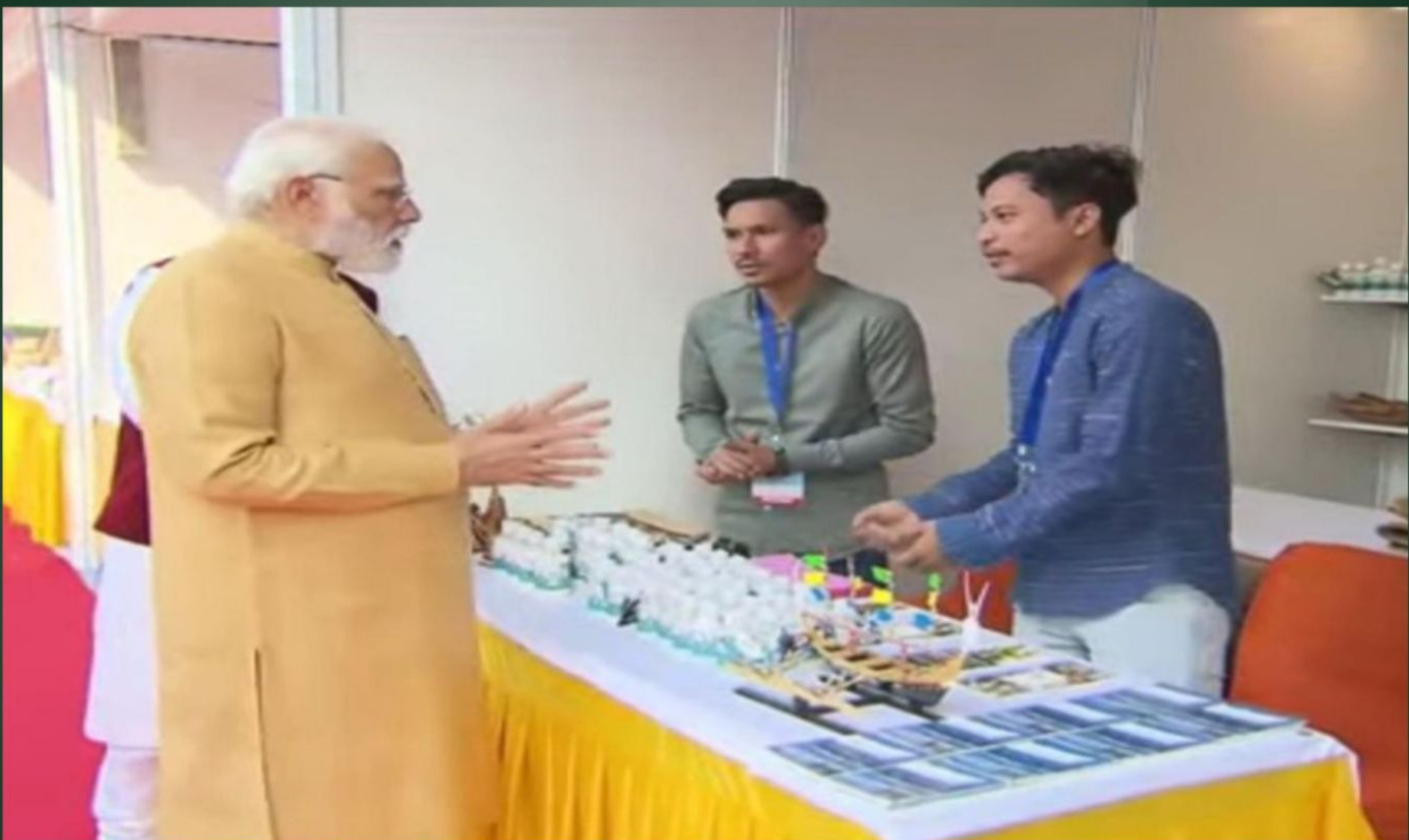
Encouragement from Hon'ble PM Shri Narendra Modi ji at the Aadi Mahotsav on 16 Feb 2023

One of its notable efforts is the promotion of “Tribes Nicobar Virgin Coconut Oil (Tavi-i-Ngaich),” a handcrafted, 100% organic coconut oil produced by local women’s Self-Help Groups using time-honored methods. In 2024, this product received a Geographical Indication (GI) Tag (No. 1057), reflecting its unique cultural and regional identity. The Society has also played a role in securing GI tags for the Nicobari Mat (Chatrai-Hileuoi) and Andaman Nicobar Coconut.