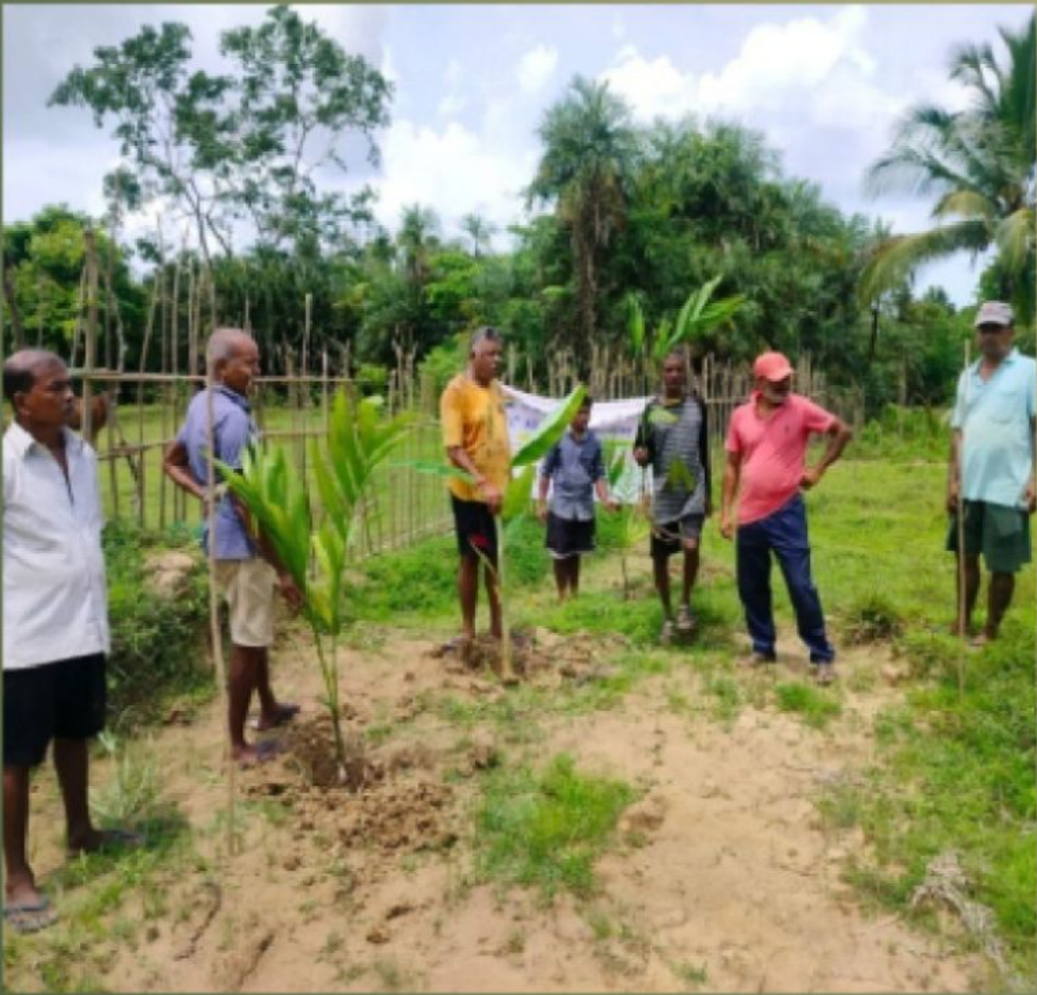
An Awareness cum tree Plantation program under the theme Ek Ped Maa Ke Naam was conducted by the member of Sabri Service Cooperative Society Ltd. Rangat on 22.05.2025