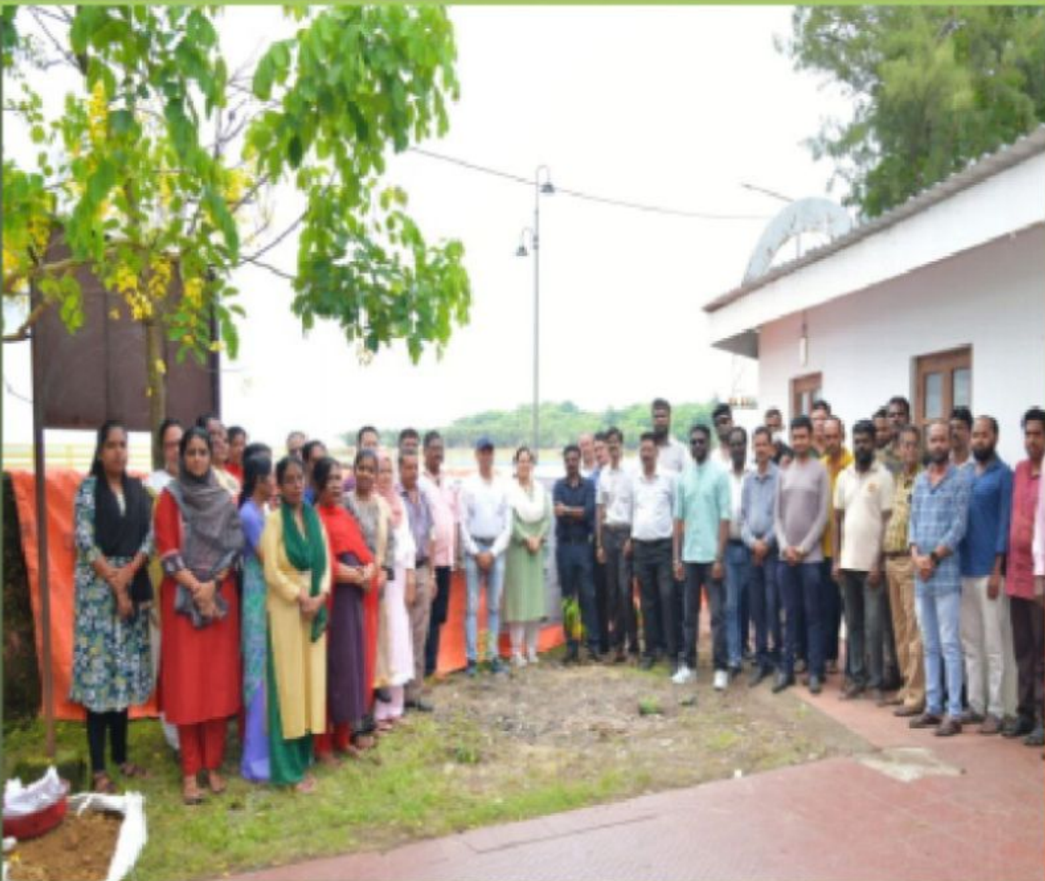
In observance of the International Year of Cooperatives-2025 the Government Press Employees Thrift and Credit Cooperative Society Ltd., in collaboration with the Department of Cooperation organized a Tree Plantation Drive on 21.05.2025