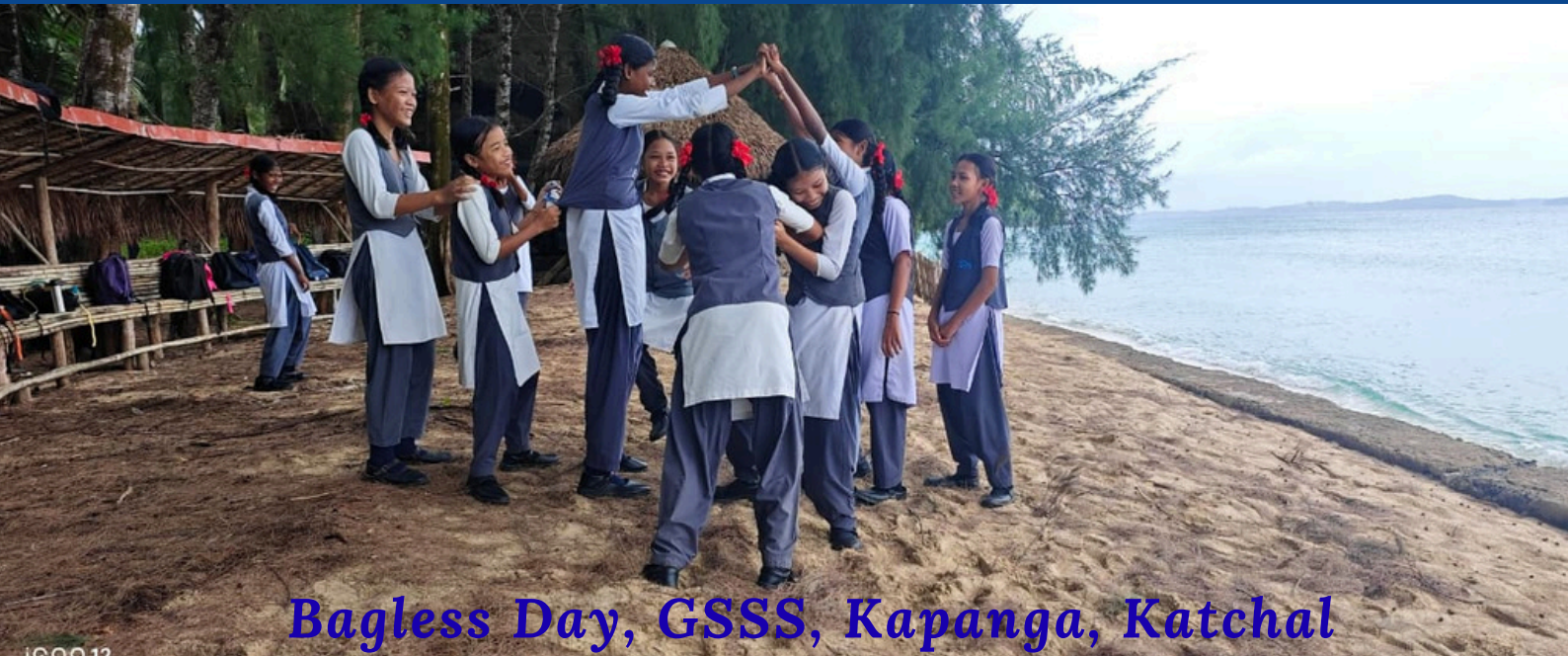
Bagless Day, GSSS, Kapanga, Katchal