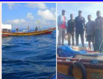
Department, Middle Andaman, Mayabunder, North & Middle Andaman.

Sri Vijaya Puram, Nov. 12 Adding yet another precious feather to its crown, the Marine Police Operational Centre (MPOC), Kadamtala, under the Police Marine Force of the Andaman & Nicobar Police, successfully rescued four fishermen from perilous deep-sea conditions. On Nov.11,2024, a distress message was received from the Fisheries